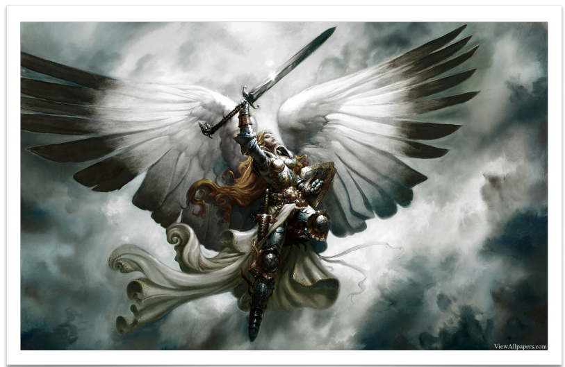
Sophia on YouTube

Women rising is valuable. AND, Women rising with the Authority to Move the Mountains that are destroying humanity and our planet is even more valuable.